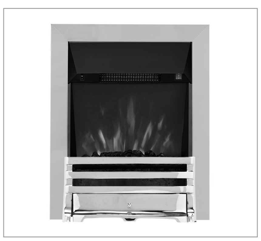
MODEL CLARA GROVE